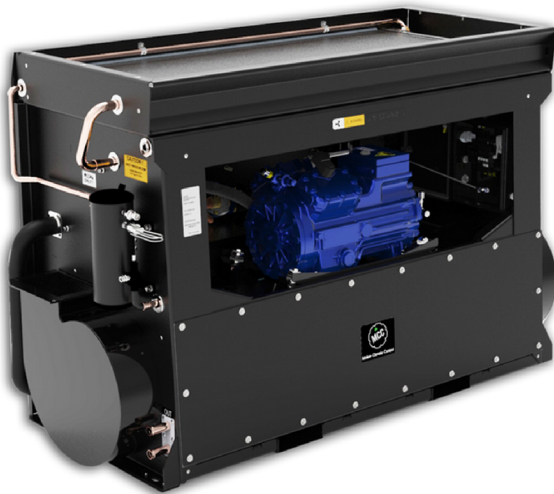
EcoTemp II Controller

BCC's Eco RMe HVAC system offers high efficiency, low maintenance, and reduces lifecycle costs. It is optimized with eco-friendly HFC R134a. BCC's advanced EcoTemp II controls and FleetTracker™ enable remote diagnostics. Supported by a nationwide service dealer network, reliability is demonstrated even in severe conditions.